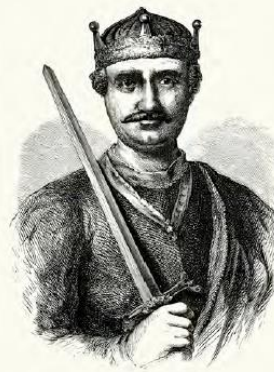
William the Conqueror, 1066