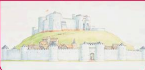
Stone keep castle