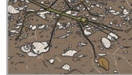
in and on soil