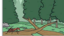
inside rotting wood